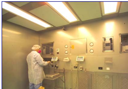
DCB-R booth 3.8 m wide, ISO 14644-1 Class 7